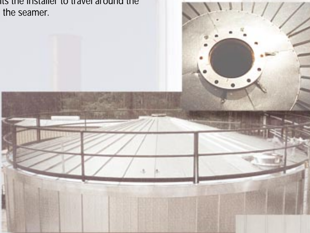
ThermaSeam panels installed radially on a tank roof provide a weatherproof surface.

The ThermaSeam system is unique in that scaffolding is not normally required for installation. A work cage attached to a nozzle or painter's lug permits the installer to travel around the tank with the seamer.