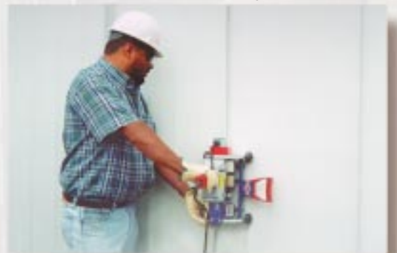
Machine used to form double-locking standing seam.