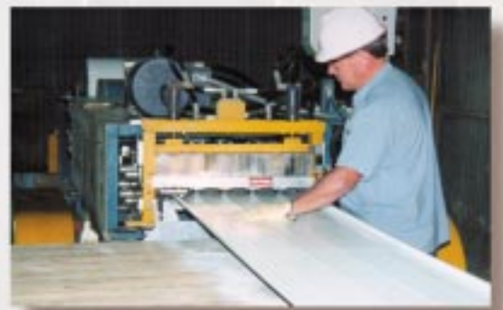
ThermaSeam manufacturing process located at Thermon's Houston, Texas, facility.