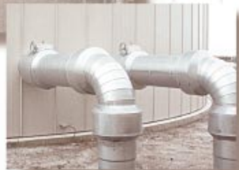
Protrusions from the tank are tightly fitted and sealed.