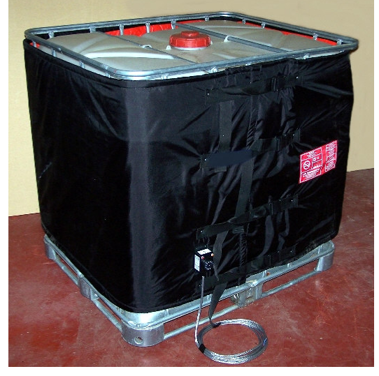
Standard IBC1 flexible heating jacket

Outer surfaces of each jacket utilize tough, water resistant nylon materials. Inner layers are manufactured using unique coated glass cloths for protection from chemicals and long term temperature durability. A heavy duty waterproof p.v.c. cover is also available for additional protection when used outdoors.