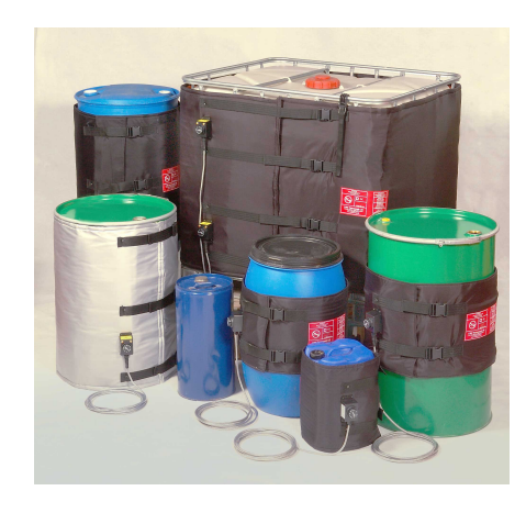
Flexible Heating Jackets for smaller containers also available plus the ATEX approved Thermosafe induction drum heater.